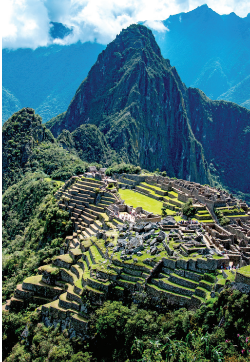
We explore the amazing ruins at Machu Picchu on Days 5 & 6.

Day 15: Quito/Depart for U.S. This morning we visit Quito’s Botanical Gardens, featuring an orchidarium with more than 1,200 species of orchids; and Iaquito Market, a colorful riot of fresh produce and spices. Then we return to the hotel for an afternoon