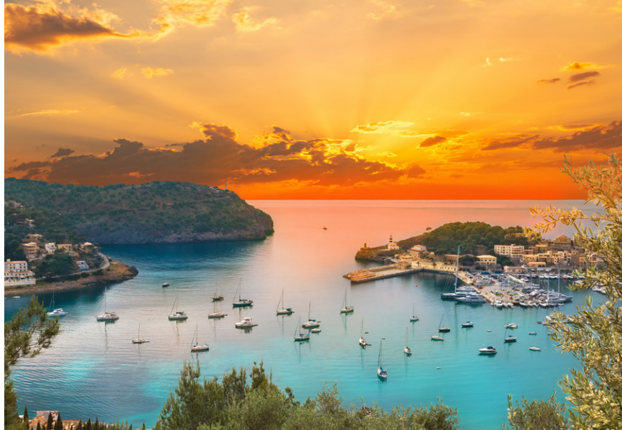
Top left: Total Solar Eclipse Phases Bottom left: Palma de Mallorca Right: Port de Sóller