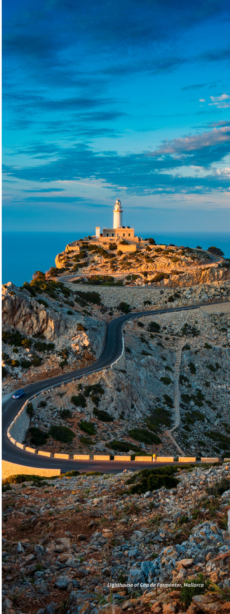
Lighthouse of Cap de Formentor, Mallorca