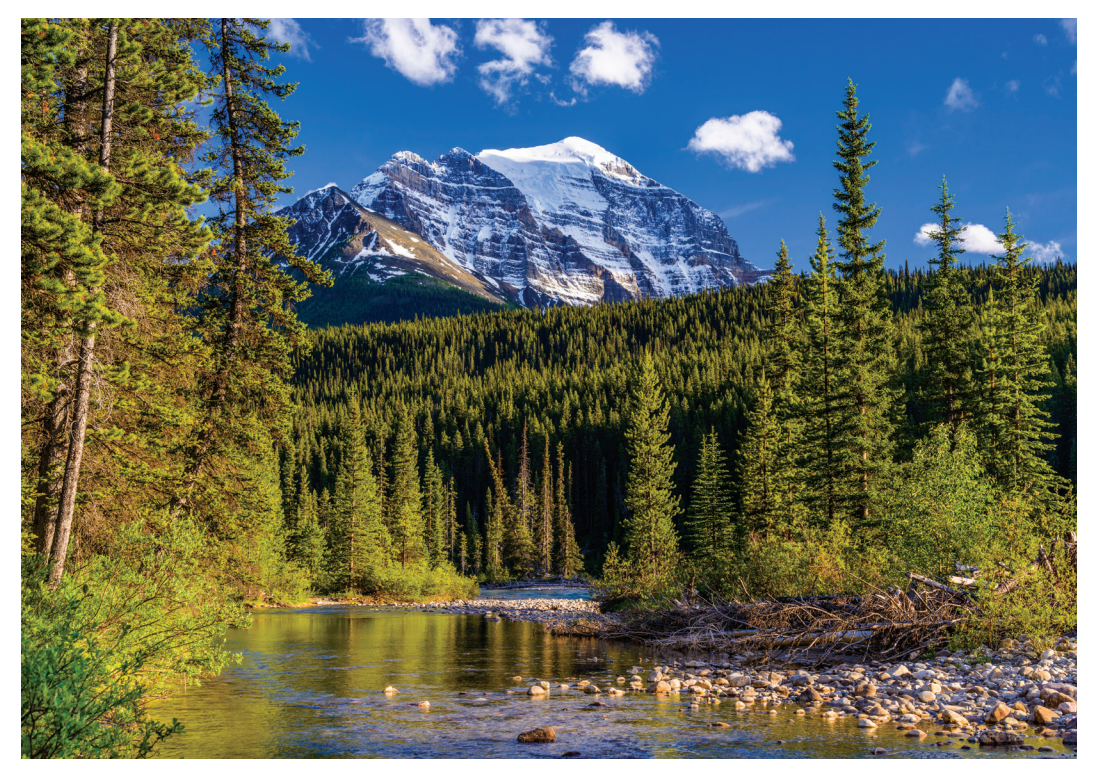
Five national parks sit within the Canadian Rockies.

a winding mountain pass that offers breathtaking views and hair-raising turns. After time for lunch on our own we meet up with our motorcoach and continue southwest across the Continental Divide. After arriving late this afternoon in the resort town of Whitefish, Montana, we dine together tonight. B , D