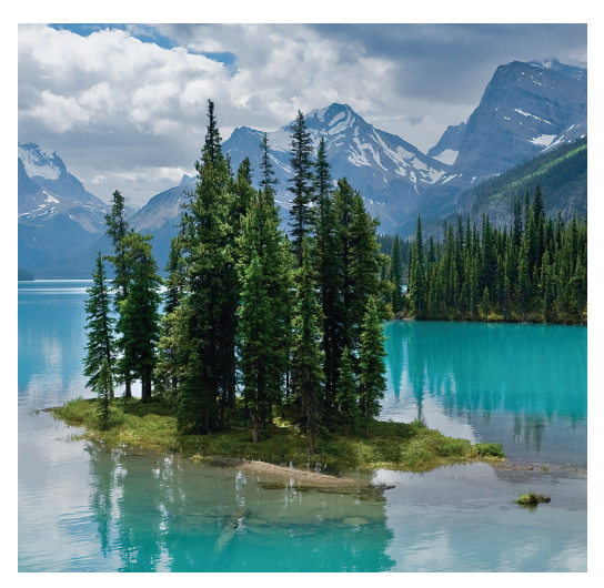
Spirit Island sits in stunning Maligne Lake.

Day 10: Banff Our last full day in the Canadian Rockies begins with a ride aboard the Banff Gondola to the top of Sulphur Mountain, so named for the hot springs on its lower flank. This 8,000-foot peak overlooking the town of Banff affords stunning mountain views in every direction; indeed, we can see six mountain ranges during this excursion. Then we travel Tunnel Mountain Road to visit two more