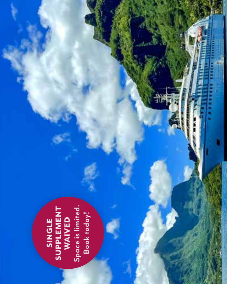
The deluxe Star-Breeze

PRSR1 STD U.S. Postage PAID Gohagan & Company