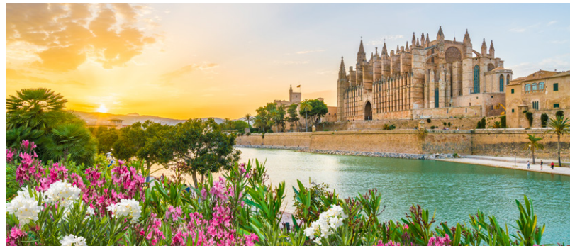
Top left: Fabra Observatory Bottom left: Park Güell / Paella in Mallorca Right: Casa Mila (La Pedrera) / Cathedral of Santa Maria of Palma, Mallorca