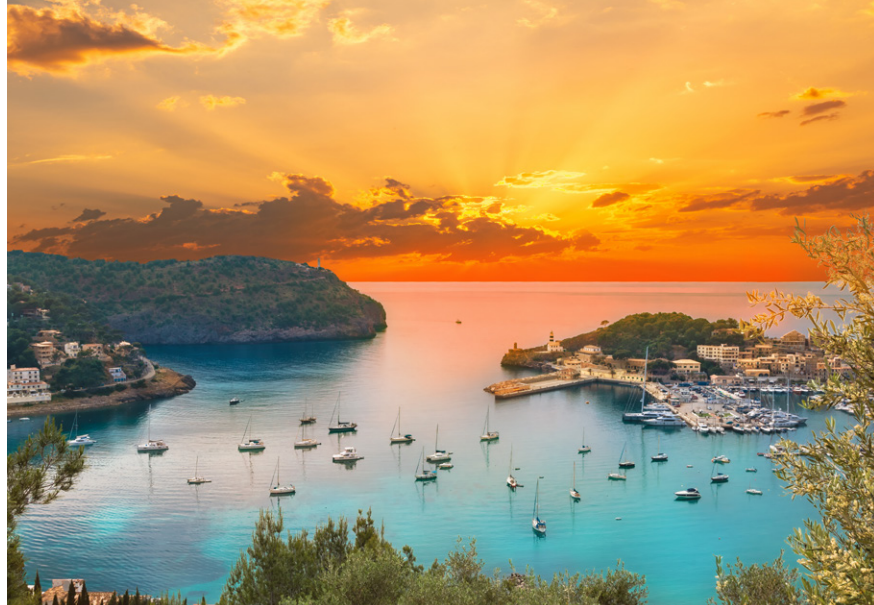
Top left: Total Solar Eclipse Phases Bottom left: Palma de Mallorca Right: Port de Sóller