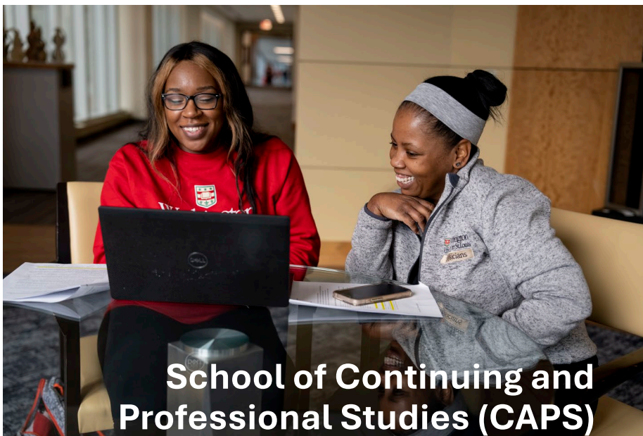
School of Continuing and Professional Studies (CAPS)