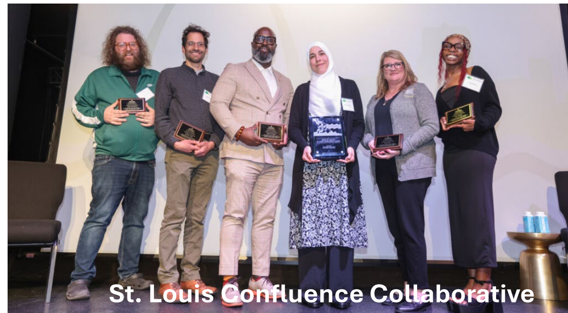
St. Louis Confluence Collaborative