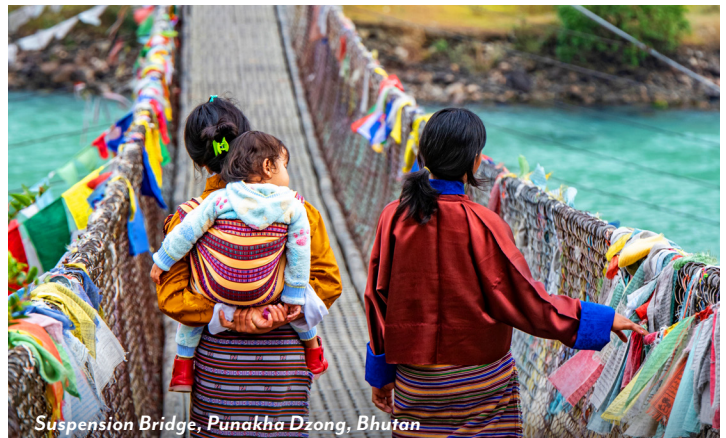
Suspension Bridge, Punakha Dzong, Bhutan

All Program Features are contingent upon final brochure pricing. 2026