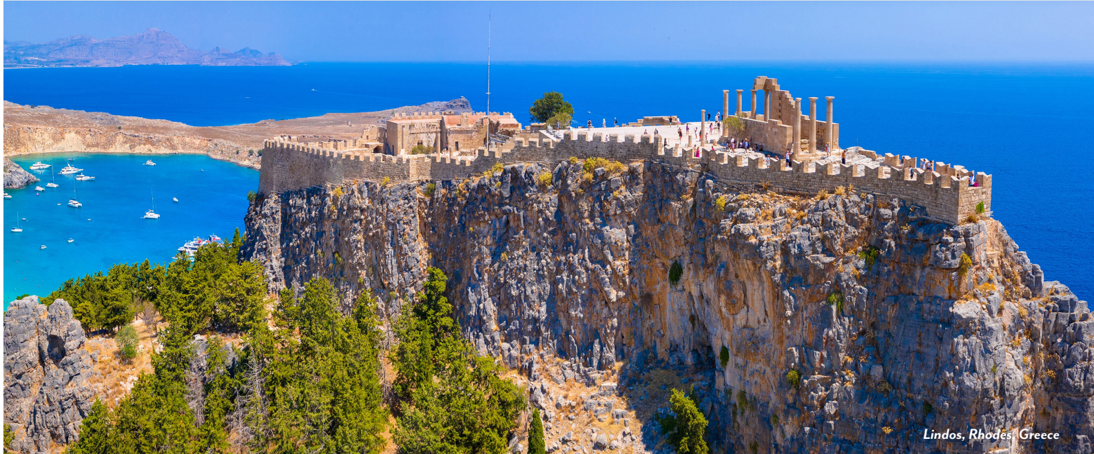
Lindos, Rhodes, Greece