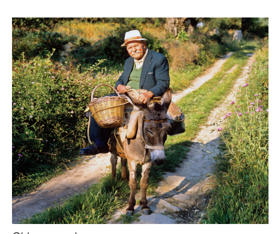
Old ways endure ...

Day 14: Depart for U.S. We transfer to Athens' international airport this morning, where we connect with our return flight home. B