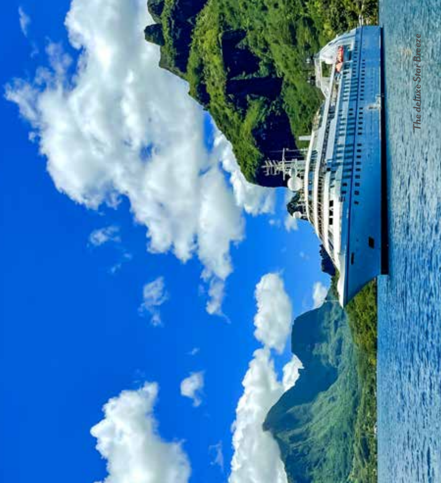
The deluxe Star Breeze